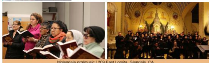
hfglendale.org/music | 209 East Loma, Glendale, CA